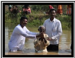
Baptism of a former witch doctor

Recently, we were in some of the remote villages ministering first at a youth rally and then a baptism service of 26 new believers, the last of which was the elderly village witch doctor, who is of course now retired from that profession!