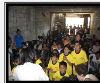
The church in Guatemala which APC helped to fund at MC 2010

Thank you APC for your generous giving through Missions Convention toward the building of a children's church in Guatemala City. There are few adults in this church but your giving made it possible to expand their influence in the community.